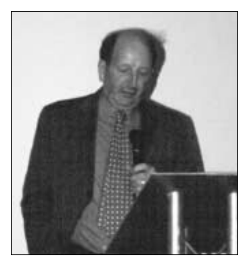
THE PRESIDENT of the UKMPA, Lord Tony Berkeley

The 2003 Conference was hosted by the Liverpool pilots and was held in the Crowne Plaza Hotel within a new development on the site of the old Princes dock in the shadow of the Liver building.