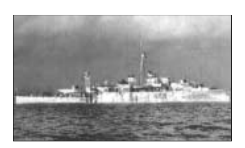
HMS Whimbrel on sea trials in 1943

To support the HMS Whimbrel preservation project, contact: conrad.waters @btopenworld.com