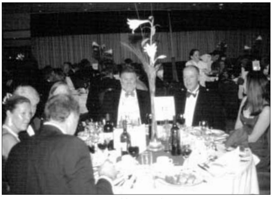
A delicious meal