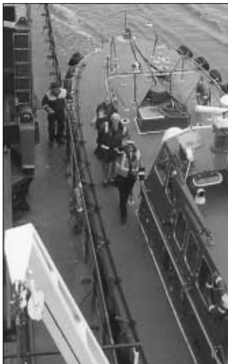
Some traditions maintained. A cheery wave on departure!

capsize at the Redcar ore terminal, which has half-discharged its iron ore cargo from Dampier and is making a short passage to Immingham.