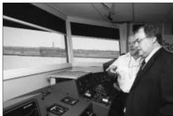
PLA pilot and simulator instructor Nigel Hall prepares a container ship passage plan for Deputy Prime Minister John Prescott. The simulator subsequently went aground!