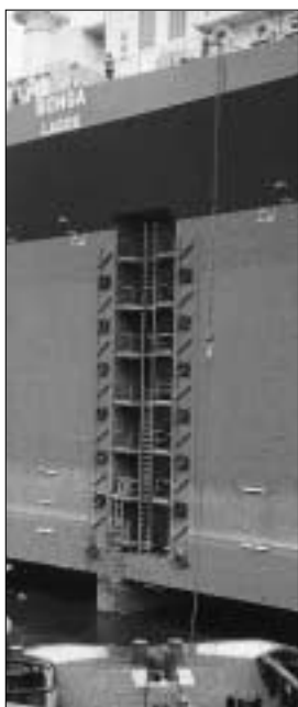
Pilot boarding point

It was not until early 2002 that TPL heard again from the fitting-out yard to enquire about pilots being sent to the South Shields simulator for training. This apparently was for the pilots to be able to handle a vessel such as Bonga ! It had escaped the attention of the enquirer that as far back as the seventies Tyne Pilots were involved with the launching, sailing, trials and dry-docking of vessels of over 325 metres LOA and 50 metres beam! It was therefore intimated to the fitting-out yard that such training would not be necessary. Having already paid tens of thousands to the Simulator, the yard were not best pleased. It appears that the Port, fired with enthusiasm by a company also charging tens of thousands to devise a risk management system to comply with the Port Marine Safety Code, had directed that a simulation exercise was required. Like Paul on the road to wherever it was, TPL pilots underwent an immediate change of heart upon realising that simulation was going to be immensely more rewarding than actually doing the job itself. As it was not possible to determine which pilots might be involved in the actual job then all TPL pilots trained assiduously on as many days as could be arranged at the simulator!! As Bonga proceeded towards the Tyne, the ETA