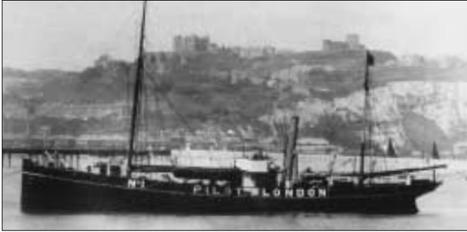
A colleague has loaned me this picture and would appreciate any information about it such as name, dates in service etc.